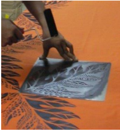
Figure 10: A demonstration of printmaking using stencil, Photo courtesy of Ieremia Gale, 2009

Use the images below to answer Numbers 34 – 41.