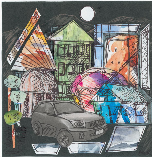
Figure 4: Collage by Moemoe von Reiche, Cityscape Apia, Teacher's Guide, Ministry of Education, Sports and Culture, 2004

Study the image below to answer Numbers 11 – 14.