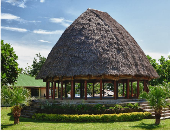
Figure 1: A photograph of a modern Samoan house.

Study both images below to answer Numbers 1 – 9.