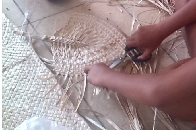
Figure 12: A young girl demonstrating how to weave a fan, Savaii, Photo courtesy of Leutogi H. Falevaai, 2015

Use the image below to answer Numbers 42 – 48.