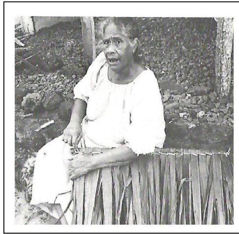
Figure 13: Photograph from the book 'The Samoan Fale', UNESCO, 1992

Use the image below to answer Numbers 49 – 54.