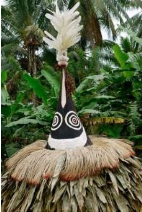
Figure 7: Tumbuan Mask from the Middle Sepik River, East Sepik Province Papua New Guinea.

Use the Figures below to answer Numbers 19 – 27.