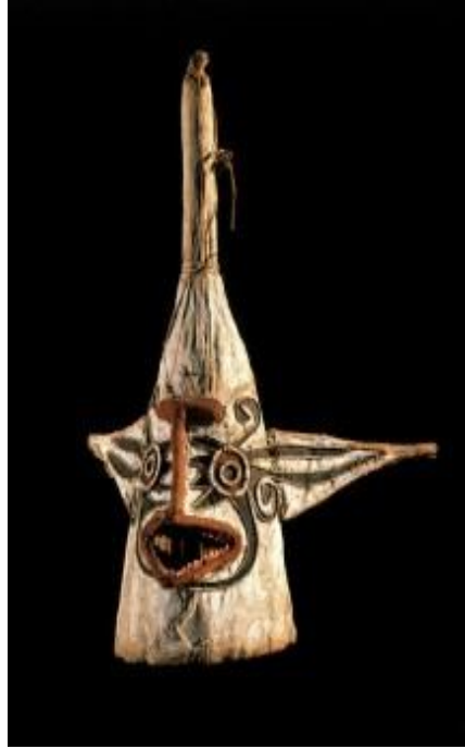
Figure 8: Mask from the Middle Sepik River, East Sepik Province Papua New Guinea.