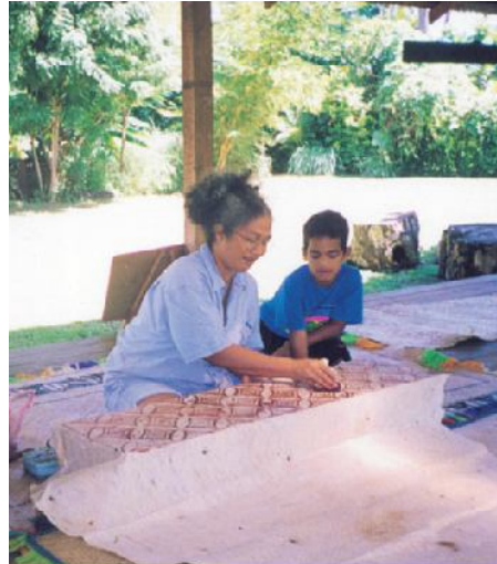
Figure 11: Siapo making at the Madd Gallery, Teacher Guide 9-10, Ministry of Education, Sports and Culture, 2004

34. In Figure 10, what materials are being used for printmaking?