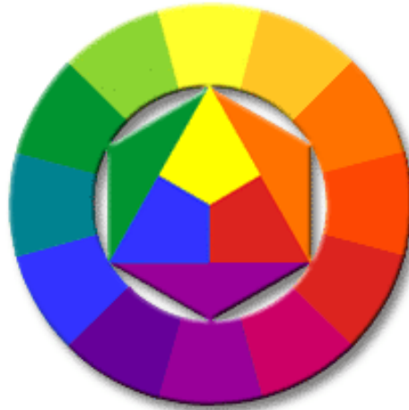
Figure 5: Colour Wheel

Study the colour wheel below to answer Numbers 15 – 18.