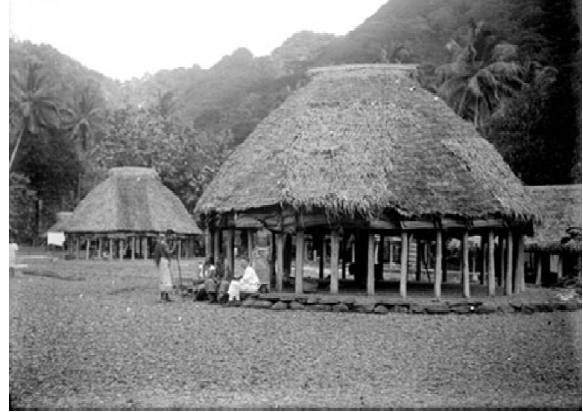
Figure 2: The traditional Samoan fale, Harry Pidgeon collection.

Source: http://138.23.124.165/ collection