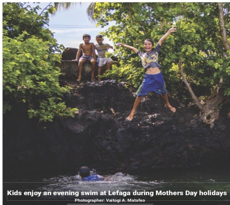
Kids enjoy an evening swim at Lefaga during Mothers Day holidays

The Ministry of Health (M.O.H.) has reported two more COVID-19 related deaths to increase Samoa's total fatalities from the coronavirus pandemic to 22. See page 2