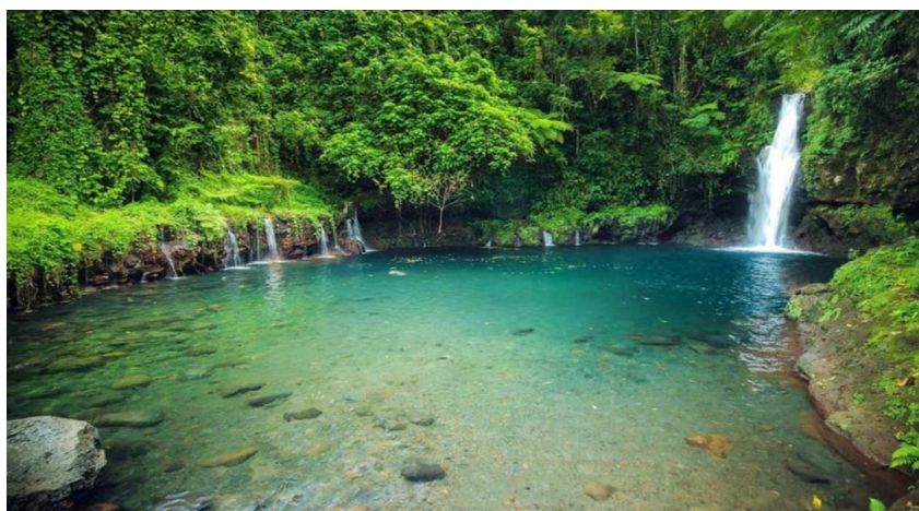
Afu a'au falls – Vailoa Palauli