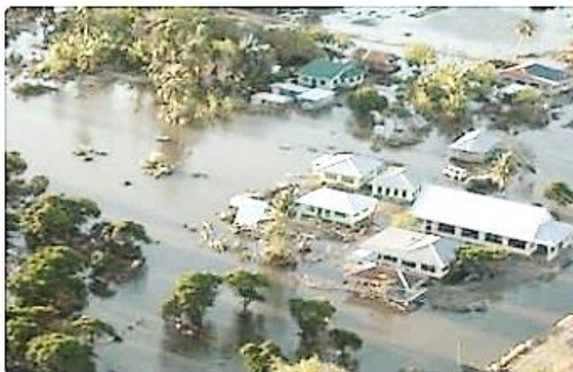
Effects of a natural hazard that occurred in Samoa