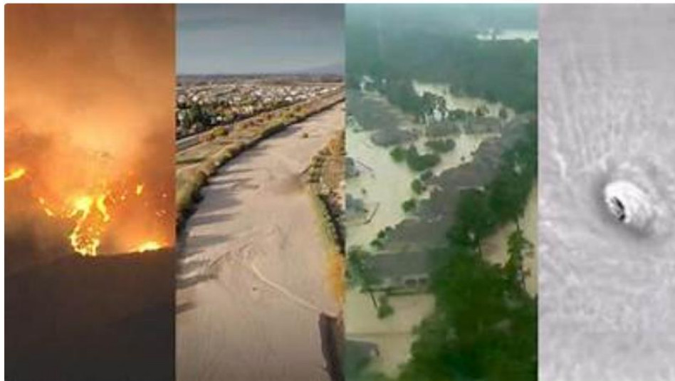
Signs of global warming

Use Resource 16 below and your knowledge to answer Question 42.