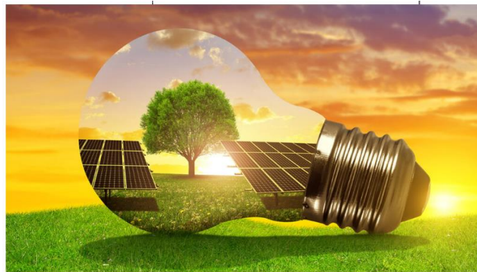
Solar Energy - The endless power of the sun | Renewable Energy